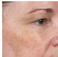
Before Clear + Brilliant