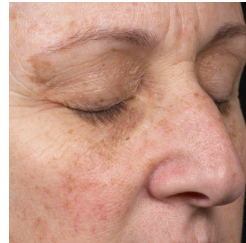
Before Clear + Brilliant

Clear + Brilliant treats fine lines, the appearance of pores, skin tone and texture.