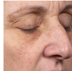
1 Week Post 6 Treatments