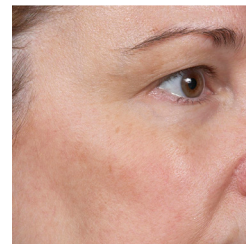
1 Week Post 6 Treatments